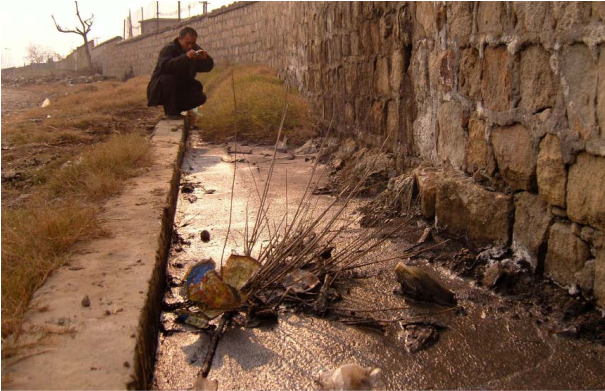
The Warriors of Qiugang still.01

Farmer turned activist Zhang Gongli documents the pollution from a chemical plant in the village of Qiugang, in Anhui Province.