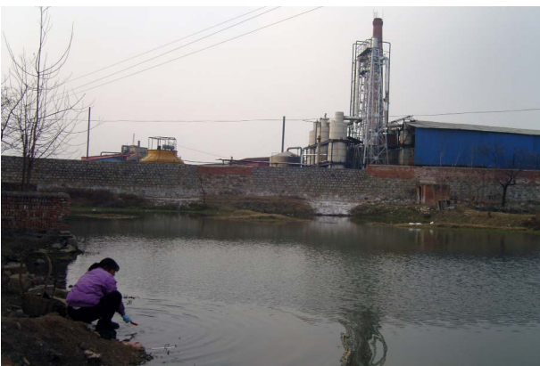
The Warriors of Qiugang still.03

Young woman wash clothing in a lake full of wastewater from the chemical factories.