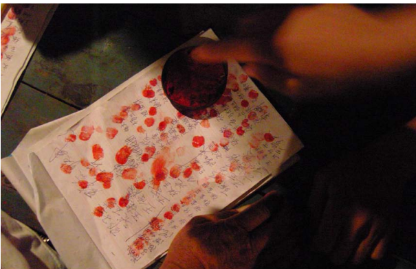
The Warriors of Qiugang still.02

More than 1800 Qiugang residents – almost the entire population of the village – signed a petition to local government leaders.